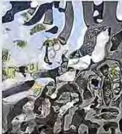
SS Water Ripple-08