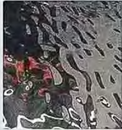
SS Water Ripple-01