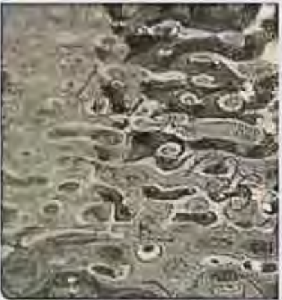
SS Water Ripple-05