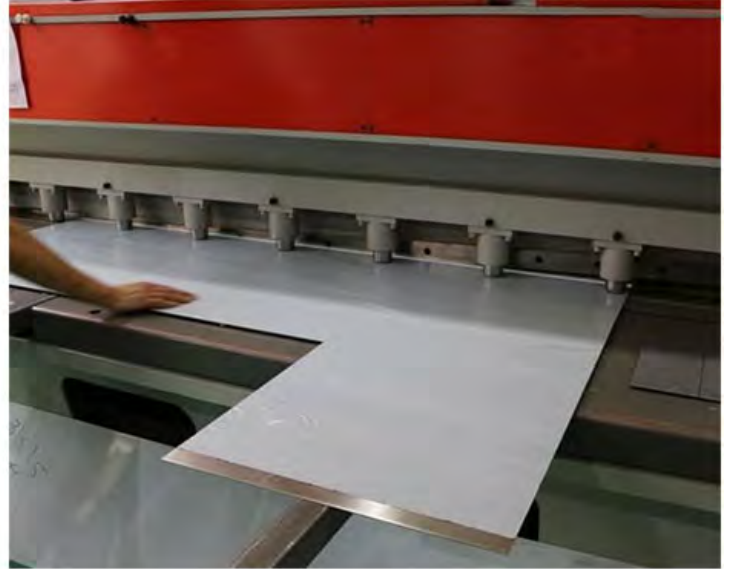
Sheet Blade Cutting