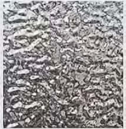
SS Water Ripple-03