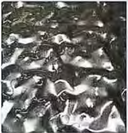
SS Water Ripple-04