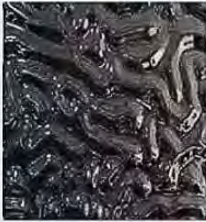
SS Water Ripple-02