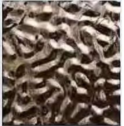
SS Water Ripple-06